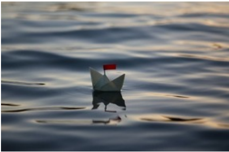
Monthly motivation: On minimizing unhappiness