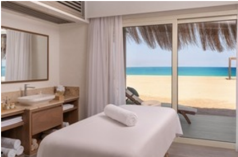
Relaxation with sea view: the Mividaspa at Steigenberger Resort Ras Soma

Diese Meldung kann unter https://www.presseportal.de/en/pm/122015/5596007 abgerufen werden.