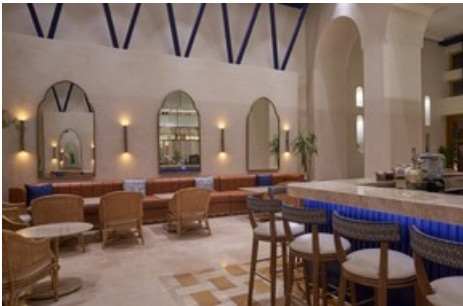
Lobby and bar at Steigenberger Golf Resort El Gouna