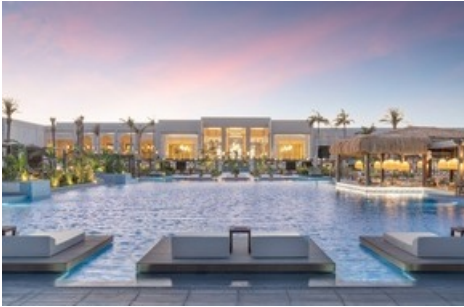
Steigenberger Resort Ras Soma with its Olympic-size pool