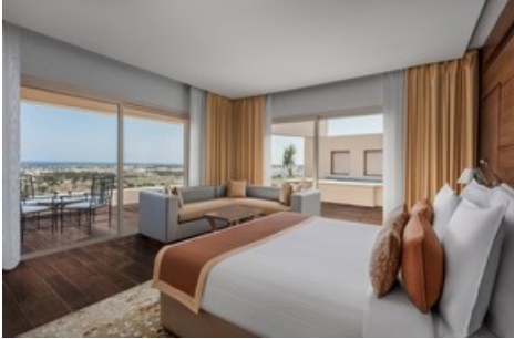
Executive Suite with bay view at Steigenberger Makadi