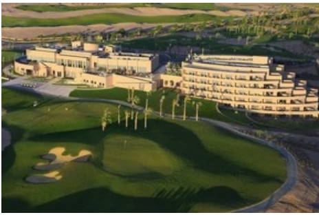
Steigenberger Makadi, nestled in an 18-hole championship golf course