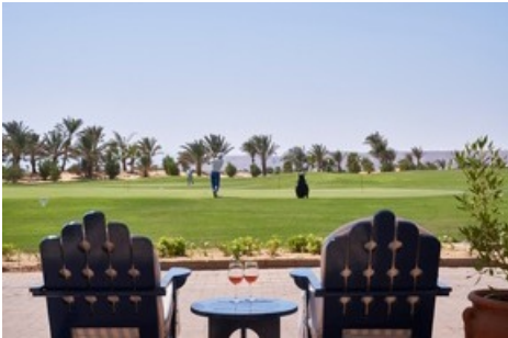
Steigenberger Golf Resort El Gouna